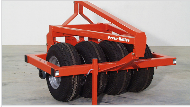
Press-Roller H760, 1.50 m.