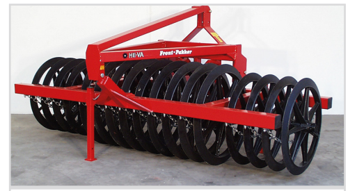
3.00 m with 800/900/800 mm rings.