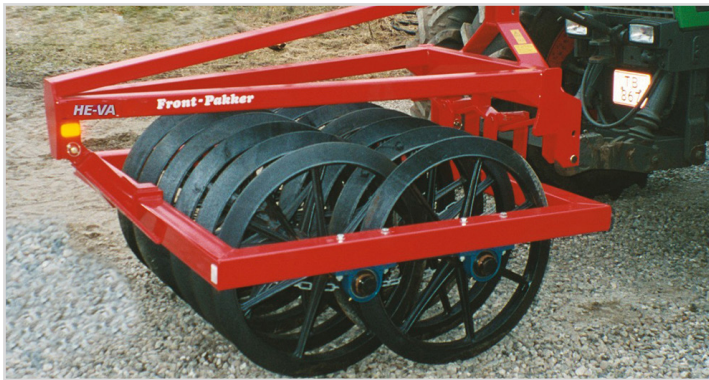
1.50 m Front-Pakker Twin with Ø800 mm.