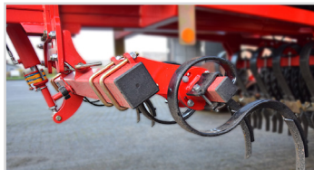
1 Requires 1 double-acting oil outlet