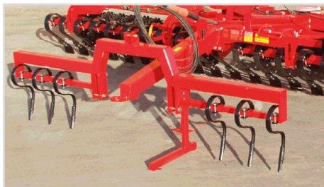
Wheel track eradicator frame for lift.