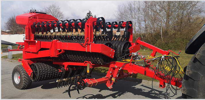
Folded Tip-Roller with Multi-Seeder, Spring-Board and wheel track eradicator.