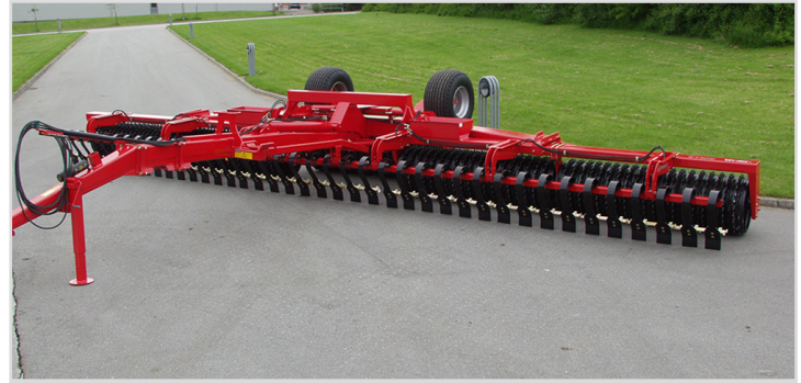
10.20 m Tip-Roller with 620 mm/24" Cambridge rings and Spring-Board with transverse locking system.