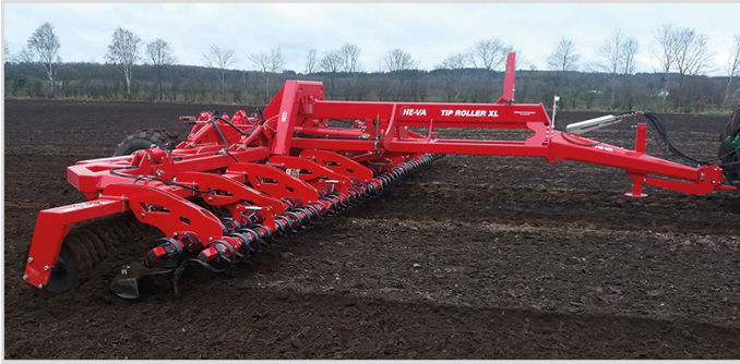
12.30 m Tip-Roller XL with Cambridge rings and 2-row Spring-Board.