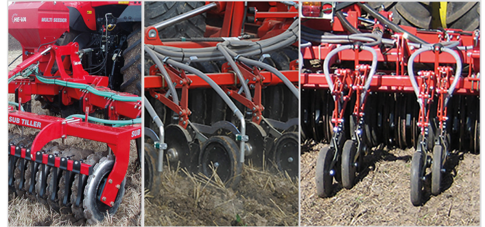
Band seeding before the packer roller

When sowing with disc coulters, a parallelogram-suspended Hatzenbichler disc coulters with double disc is used. The disc has a diameter of Ø350 and a thickness of 3 mm, while the pressure roller has a diameter of Ø330 and is either 75 or 50 mm wide.