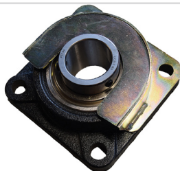
Bearing protector for packing roller.