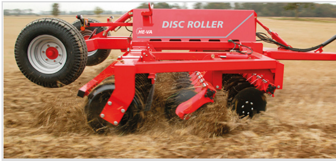
5.00 m with V-Profile ring and material damper guard.