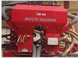
Twin 2 x 100 593x926(1,180)mm H=935 (1,075) mm