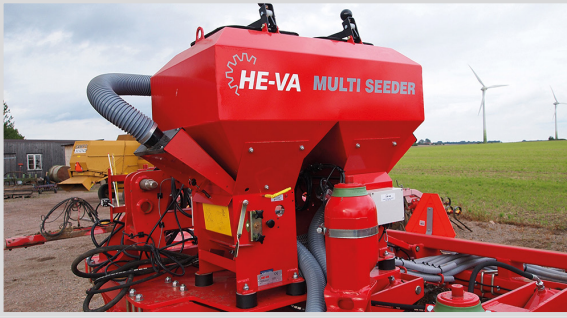
Multi-Seeder Twin 2x100-8-HY-AC 593 x 926 (1,180) mm H=935 (1,075) mm