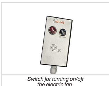
Switch for turning on/off the electric fan.