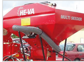
410-8-HY 800x1.200 mm H=1,030 (1,180) mm