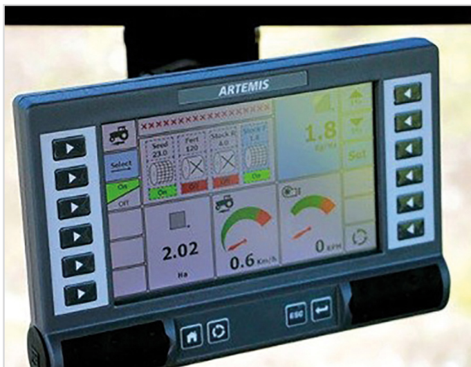
HE-VA terminal for Multi-Seeder Twin and for mounting 2-3 Multi-Seeders.