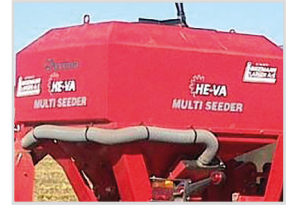
1150-8-HY-FZ-AC 1,014x1,640 mm H= 1,530 mm