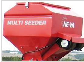
200-8-EL 650x650(770)mm H=980 mm