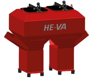
Multi-Seeder Twin 90/140-12-HY-AC 668 x 800 (1,180) mm H=900 (1,076) mm