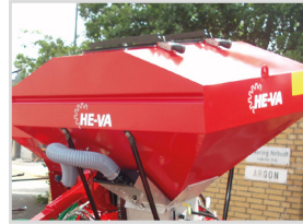
660-8-HY-FZ-AC 900x1,400 mm H=1,170 (1,320) mm