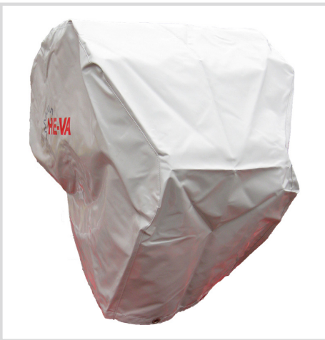
Tarpaulin for Multi-Seeder.

1 In case of another length of driving cable than the standard 1.8 m, the price will be corrected in relation to standard price.