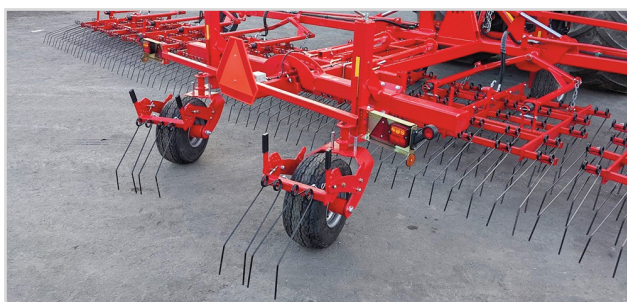
Wheel set, rear.

1* The equipment requires 1 additional double-acting oil outlet.